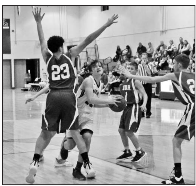
TCMS knocked off Highlands, NC last week.

The Indians started the second period red hot, getting a stop on defense and hitting back-to-back shots on offense to put them back up by 1. But Hayesville managed to regain the lead yet again due to several Indians having to sit from foul trouble.